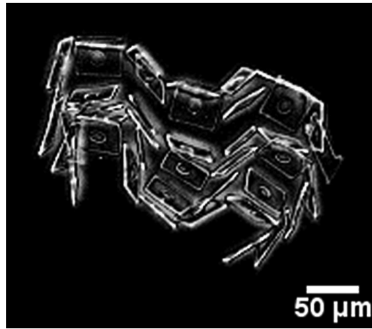
Figure 3: A spacer Miura-ori fold made using ultra-thin, self-folding atomic layer deposited sheets.

The manufacturing process is fully compatible with the microelectronic fabrication technology, making it easy to integrate with control circuit. These results could lead to new micro- or nano- electromechanical systems for robotic applications.