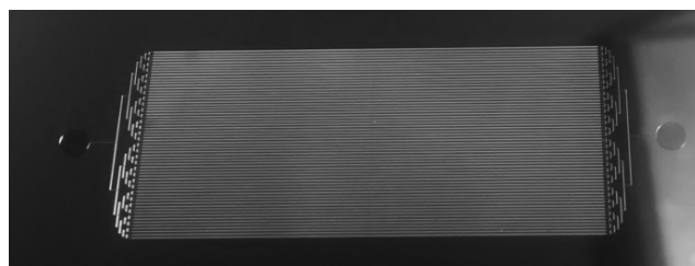
Figure 3: Etched silicon mold for hot pressing.