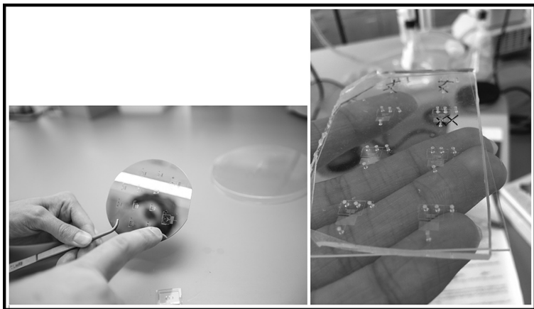
Figure 2: Left: SU-8 wafer with patterned structures. Right: A series of eight PDMS microfluidic devices.