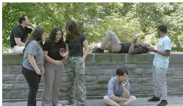
Above, the 2023 CNF REU Interns BEFORE the program.

Since 1991, CNF has hosted an NSF-funded Research Experiences for Undergraduates (REU) Program — an informative ten-week summer research experience for a diverse group of talented undergraduates. We’ve since added two 2nd-year programs in collaboration with the National Institute for Materials Science (NIMS) in Japan — the CNF International Research Experiences for Undergraduates (CNF iREU) Program and the CNF International Research Experiences for Graduates (CNF iREG) Program. For the CNF iREU, we send 8-10 NNCI REU interns to Japan for a summer of international research and in return, for the CNF iREG, NIMS sends several Japanese graduate students to the NNCI sites. In 2023, the CNF hosted seven CNF REU interns, plus one CNF iREG. And eight NNCI REU participated in the CNF iREU Program. All their final reports can be found online at https://cnf.cornell.edu/education — along with websites for all the education and outreach activities mentioned above!