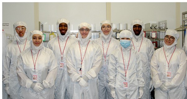
Below, the 2023 CNF REU Interns AFTER the program!