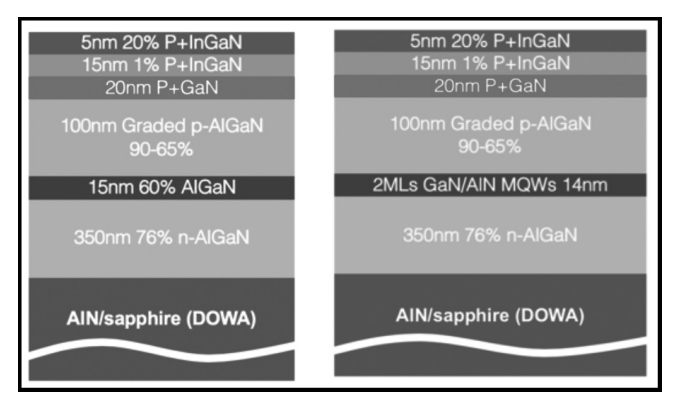
Figure 1: Schematic structures of the UV LEDs grown in this study. On the left is the AlGaN active region LED, and on the right is the ultra-thin GaN active region LED. The AlGaN LED has one single quantum well, while the ultra thin GaN LED has 4 quantum wells separated by 2 nm AlN barriers.

It can be seen that that the electrical performance of the devices are fairly similar between the two structures, with current densities reaching \sim 500 \text{ A/cm}^2 at 10V. The